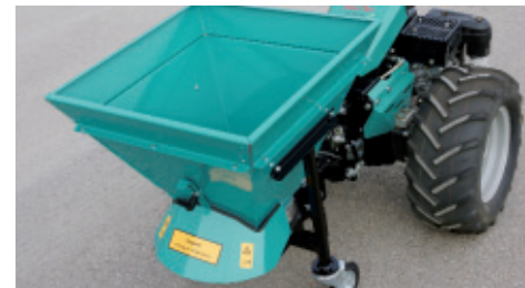
Spreader for fertilizer, sand or road salt

100 l, spreading direction adjustable (left-center-right)