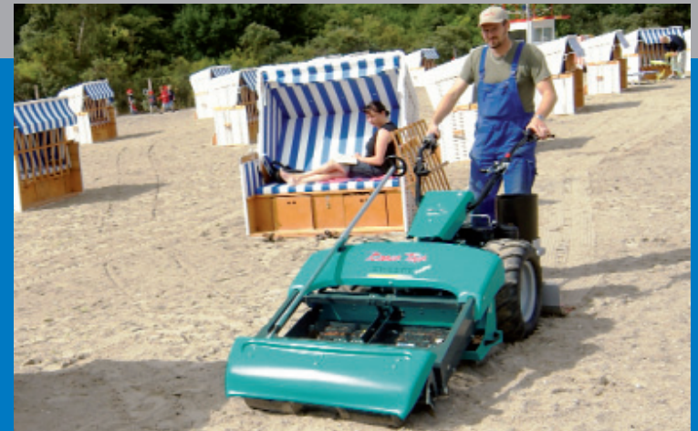
BeachTech Sweepy hydro