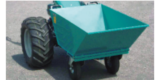
Front transport bin: 140 liter capacity, easy to operate tilting device, 2 large pneumatic tires